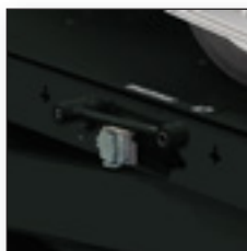
MKS alignment sensor brackets and Harting rack wiring box

133-67-1 4,500-lb. capacity swing air jack