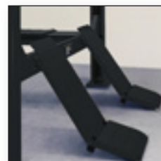
Low-profile 2-stage ramps