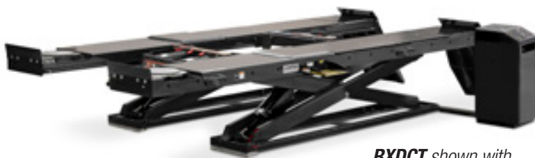
RXDC shown with optional second jack